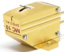
The MC – 10 Special

(*) Special: Indicates the following improvement: A thicker front pole, to enhance the resolution capabilities of The MC – 10 Special.