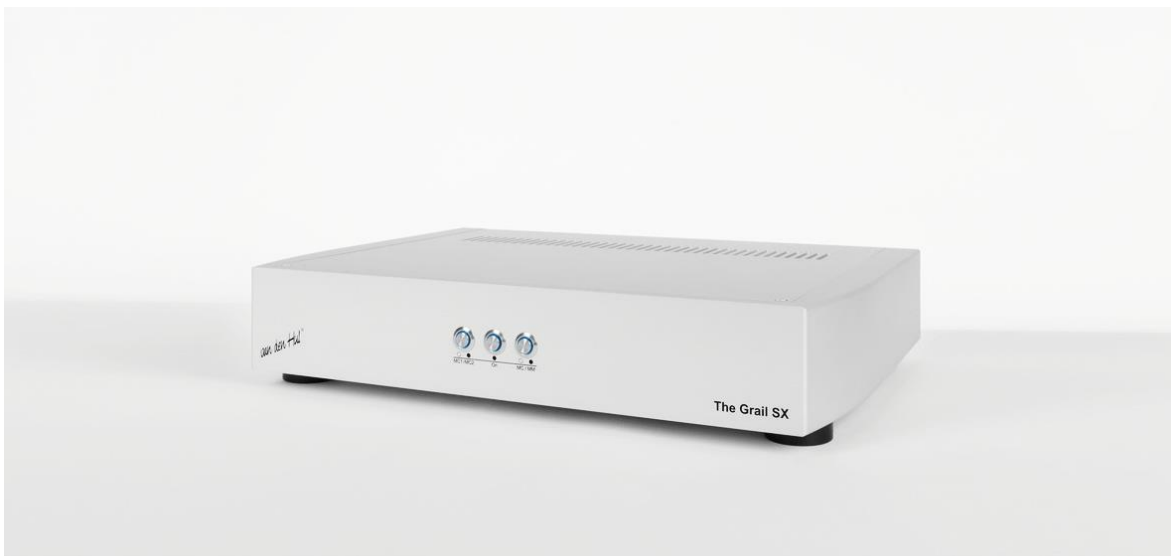
The Grail SX Amp

With this product, you are the owner of one of the most innovative and advanced phonograph preamplifiers available at the moment. It delivers fully balanced inputs and outputs. "The Grail SX" is a really dulcet phonograph preamplifier, specifically designed to bear ultimate performance and reliability in mind.