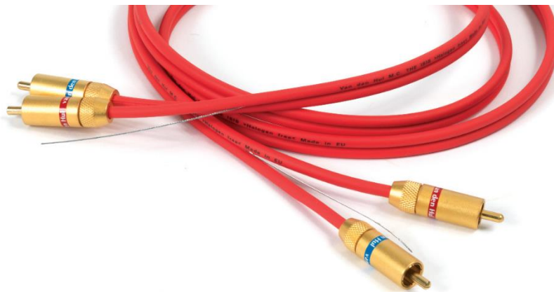
The Isis > Halogen Free < Made in E.U.