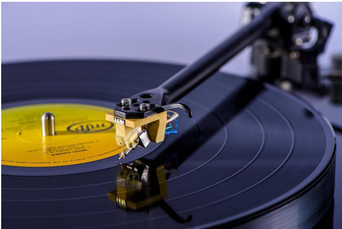
The Colibri XGW Master Signature