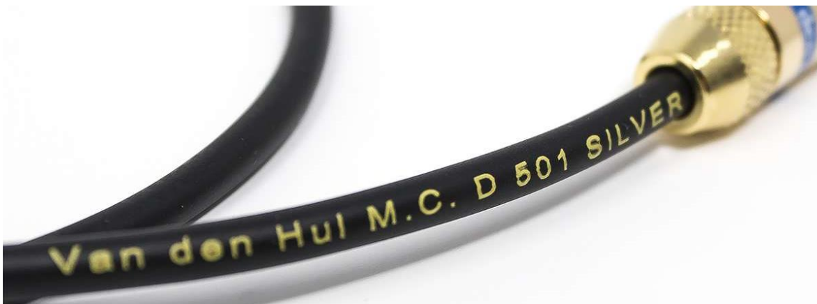
D - 501 Silver Hybrid > Halogen Free < Made in E.U.