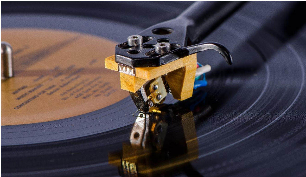
The Crimson – XGW Master Signature