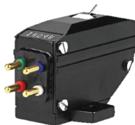
The MC – One Special

(*) Special: Indicates important improvements: A thicker front pole and an extra magnet, to enhance the resolution capabilities and magnetic field of The MC – One Special