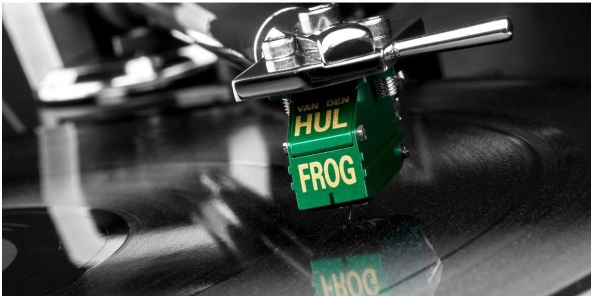
The Frog Gold