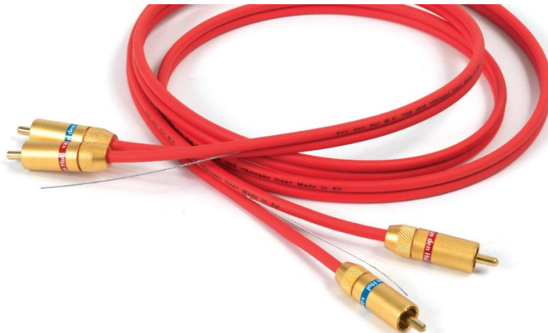
The Isis > Halogen Free < Made in E.U.