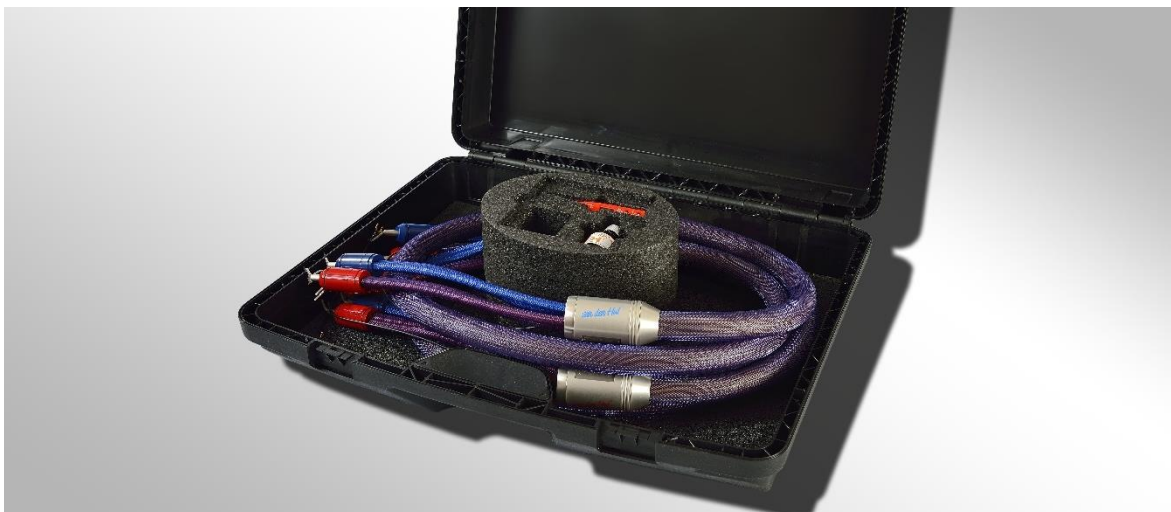
3T The Cumulus Hybrid Limited Edition > Halogen Free < Made in E.U.