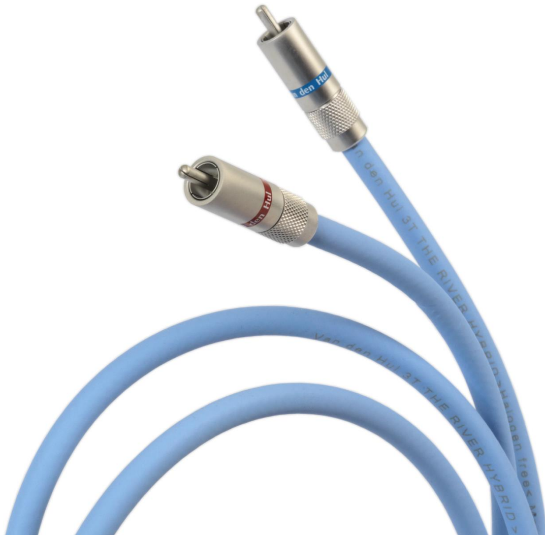
3T The River Hybrid > Halogen Free < Made in E.U.