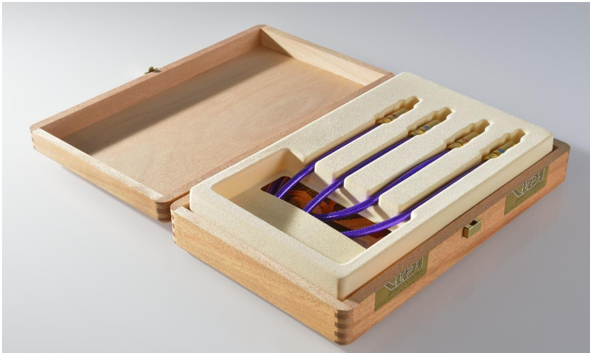
The MC Silver IT 65G > PVC Free < Made in E.U.