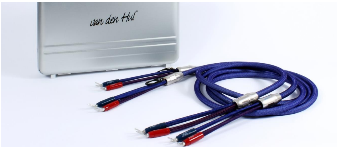
3T The Cloud Limited Edition