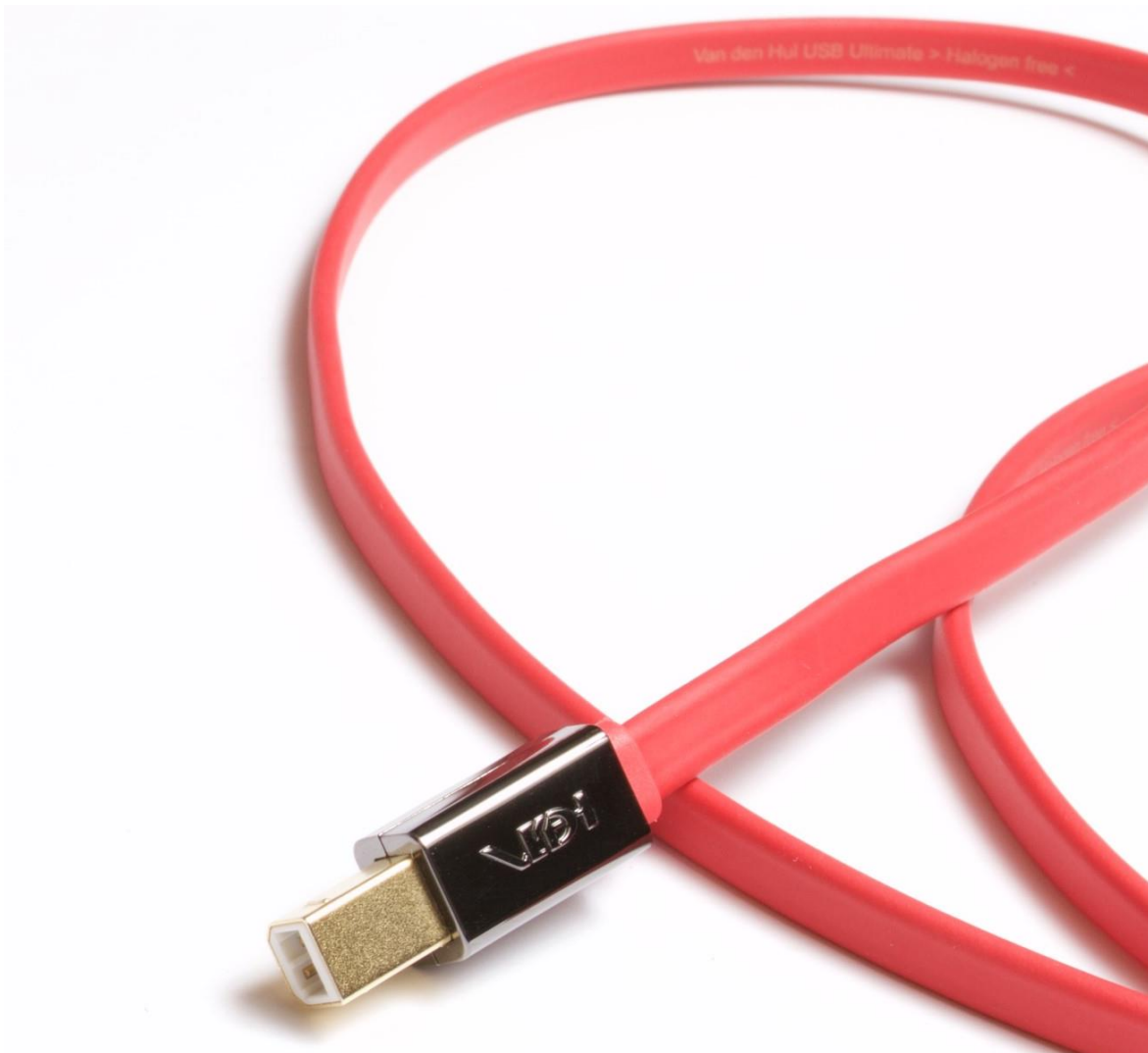
The VDH USB Ultimate > Halogen Free <