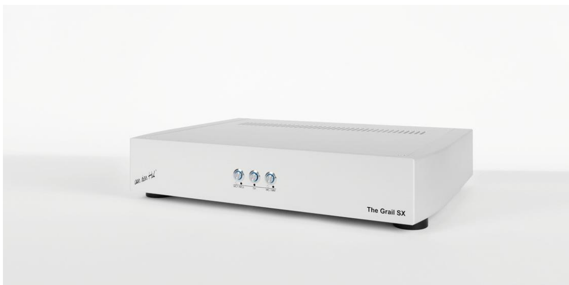
The Grail SX Amp

With this product, you are the owner of one of the most innovative and advanced phonograph preamplifiers available at the moment. It delivers fully balanced inputs and outputs. "The Grail SX" is a really dulcet phonograph preamplifier, specifically designed to bear ultimate performance and reliability in mind.