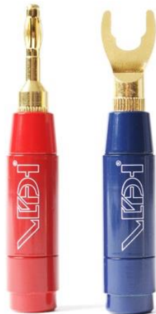
BERRI Bus 8.3mm with spade and BERRI Bus 8.3mm with banana