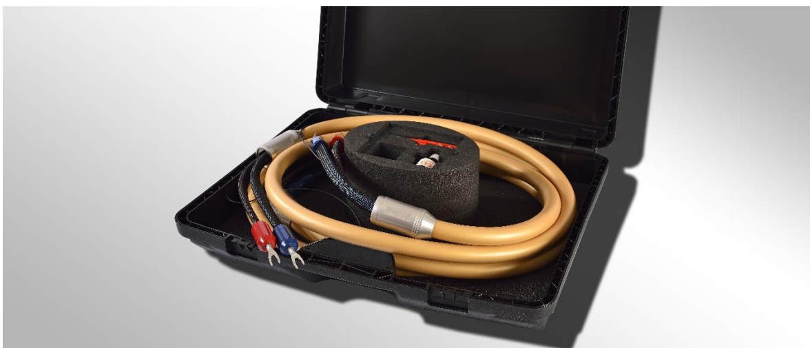
3T The Cumulus Hybrid > Halogen Free < Made in E.U.