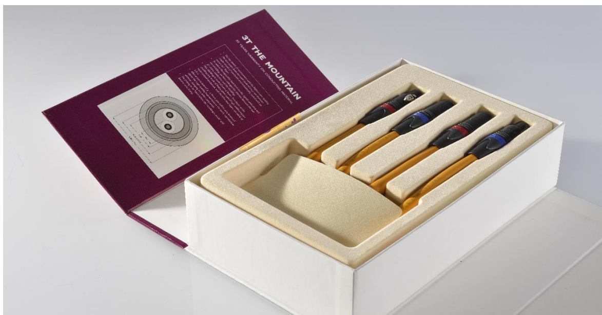
3T The Mountain Hybrid > Halogen Free < Made in E.U.