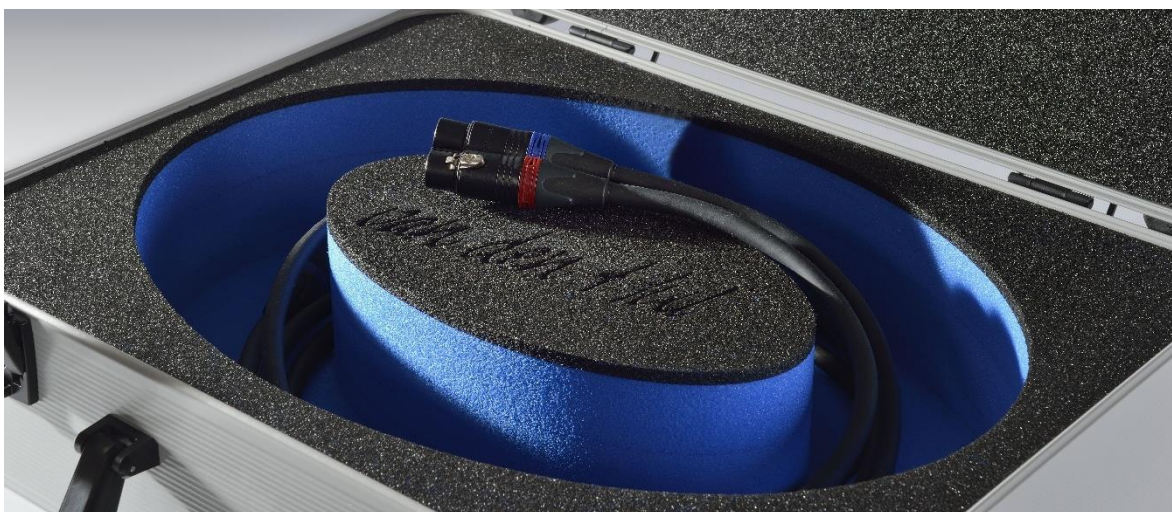
The CNT > Halogen Free < Made in E.U.