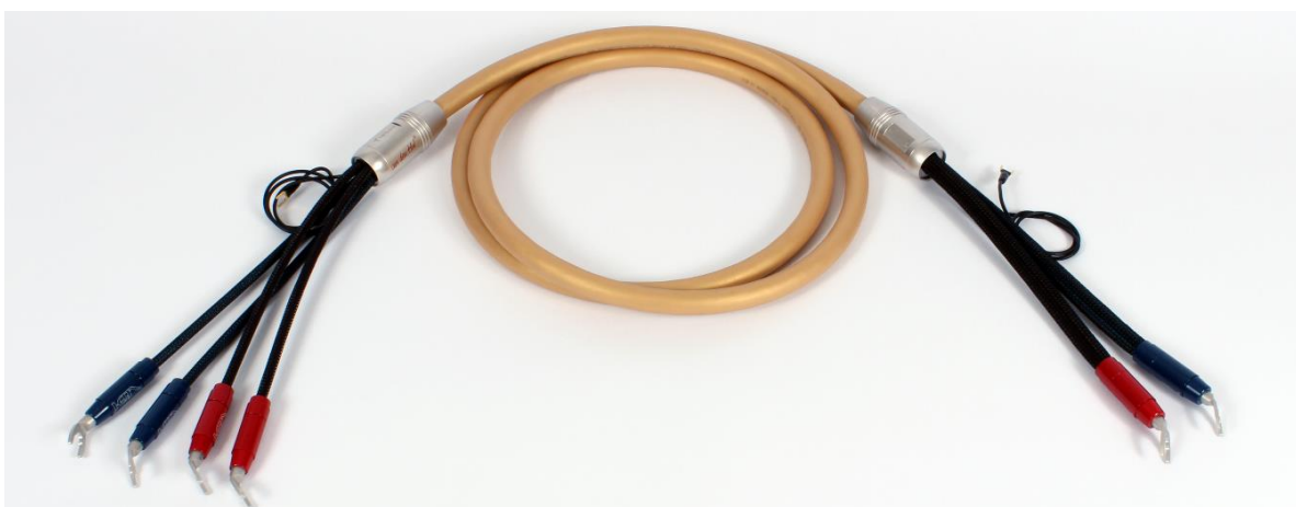
Mounted set 3T The Cloud SE > Halogen Free < Made in E.U.