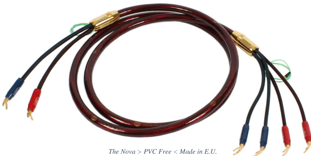
The Nova > PVC Free < Made in E.U.