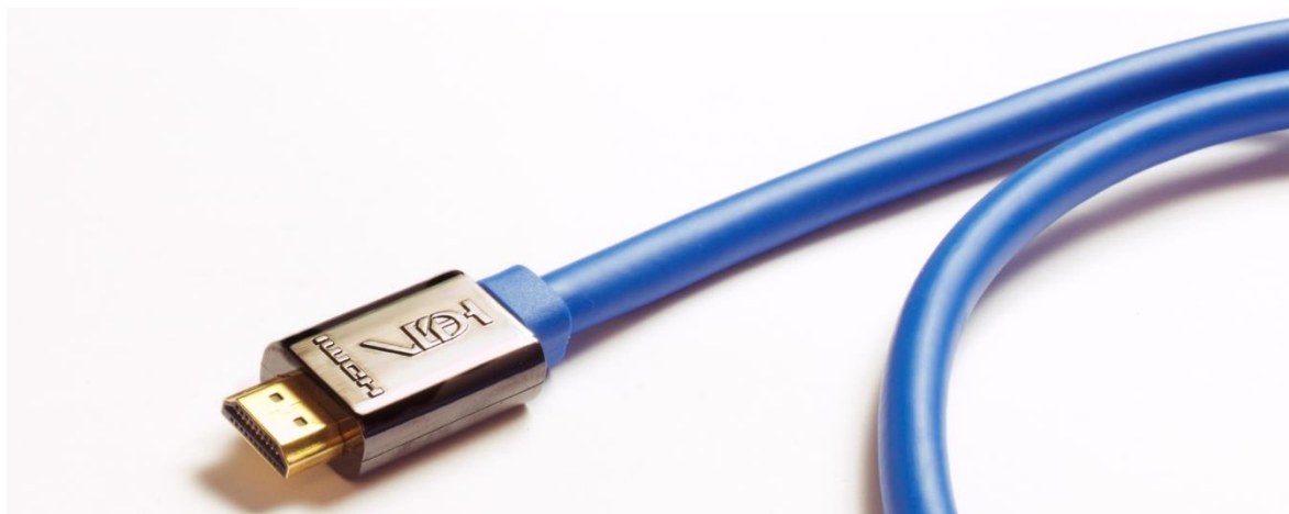
The VDH HDMI Ultimate 4K HEAC > Halogen Free <