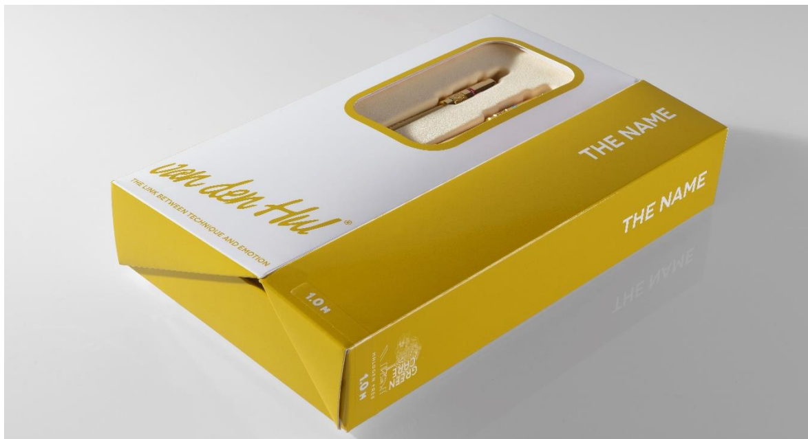
The Name > Halogen Free < Made in E.U.