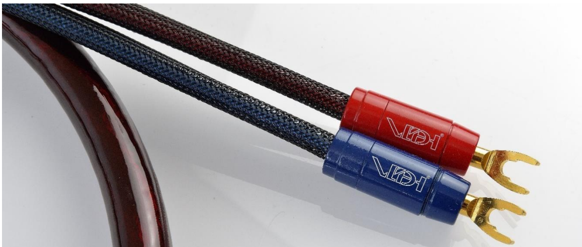
The Super Nova > PVC Free < Made in E.U.