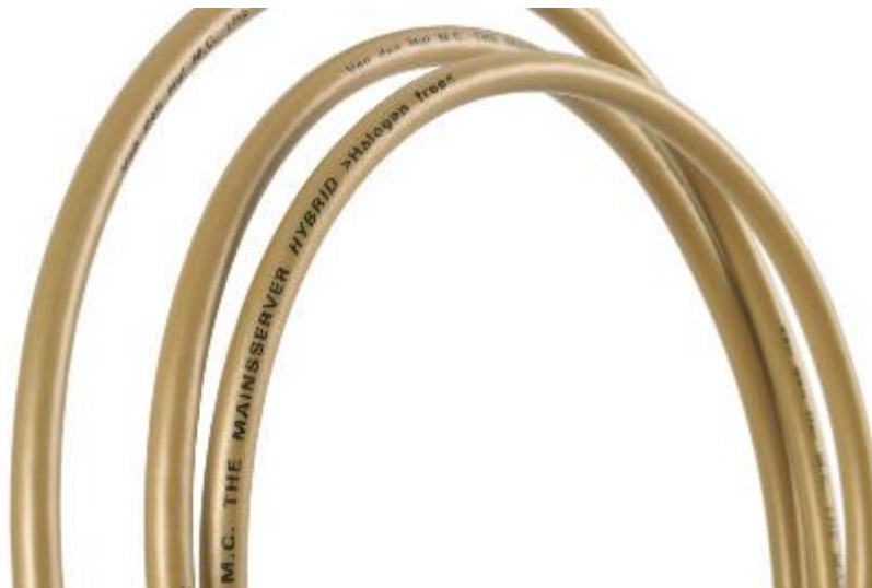
M.C. The Mainsserver Hybrid > Halogen Free < Made in E.U.