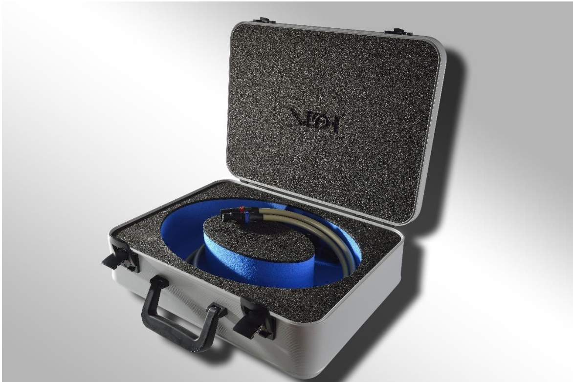
The Platinum Hybrid Mk II Balanced > Halogen Free < Made in E.U.