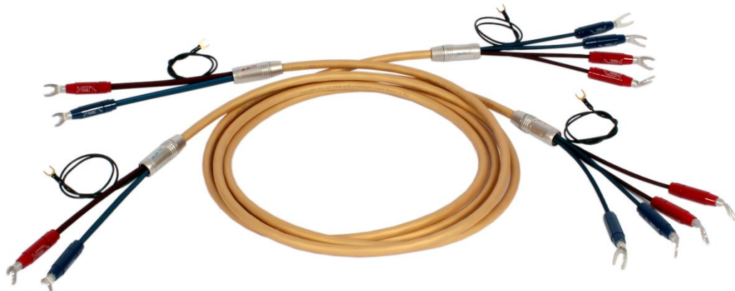
3T The Air > Halogen Free < Made in E.U.