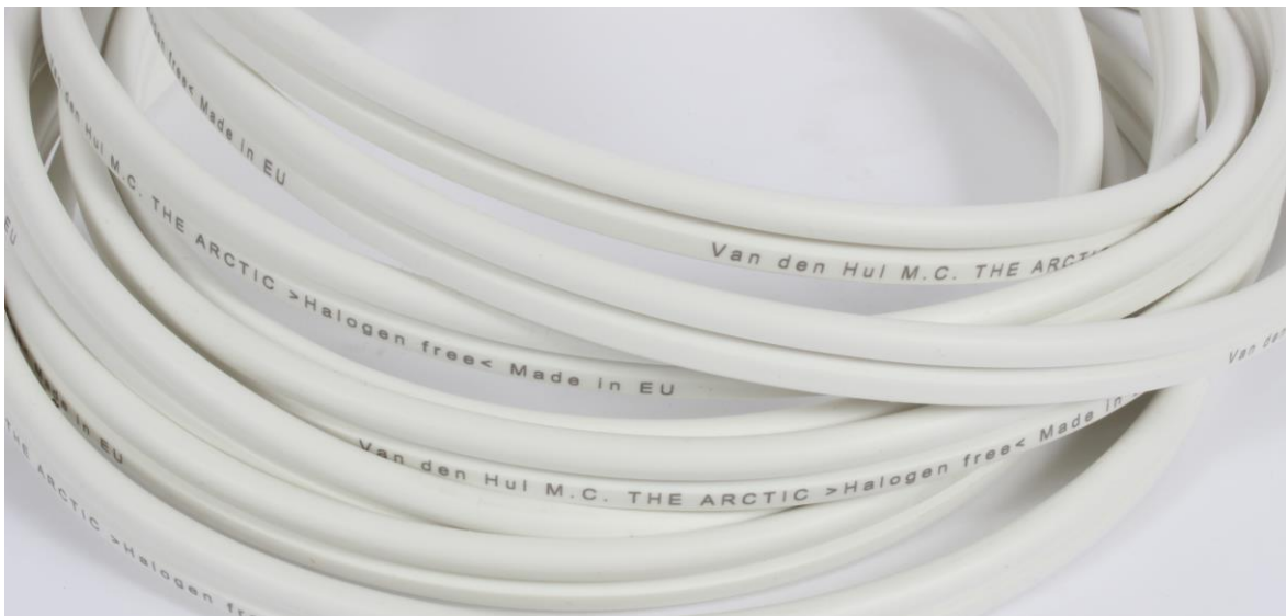
The Arctic > Halogen Free < Made in E.U.